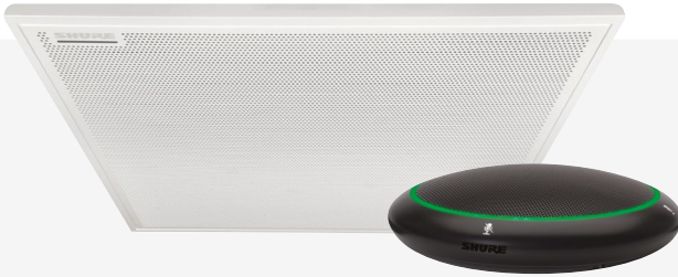
MXA910 | MXA310